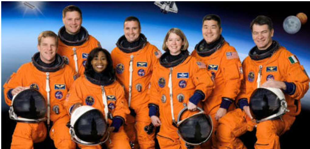
The official portrait of the seven member STS-120 crew.