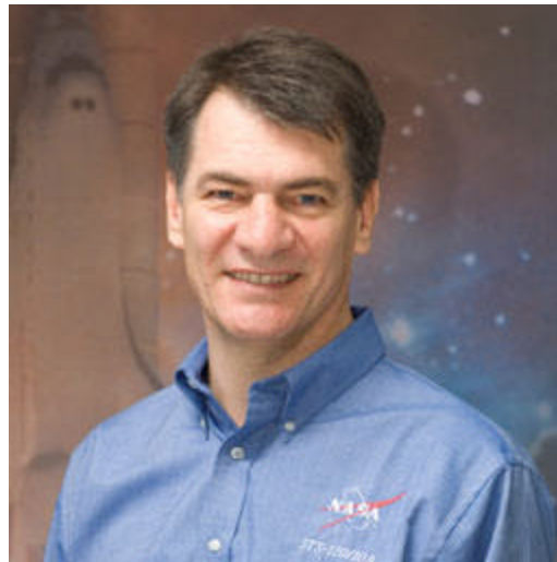
STS-120 Mission Specialist Paolo A. Nespoli (ESA).