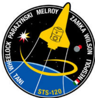
The STS-120 insignia.

The Italy-America Chamber of Commerce of Houston is proud to wish him a good luck!